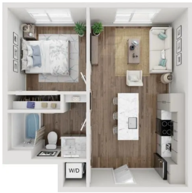
NITROGEN MICRO - 590 SF