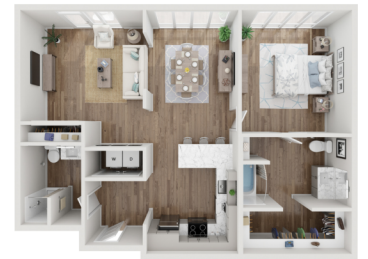
NITROGEN MAX LIVE WORK 1,052 SF