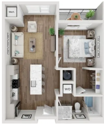
NITROGEN CARBON - 639 SF