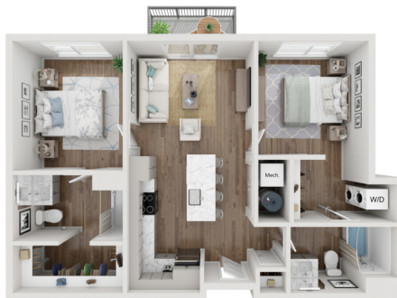
HYDROGEN COBALT - 955 SF