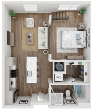
OXYGEN MAX - 691 SF