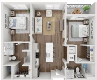
HYDROGEN MICRO - 953 SF