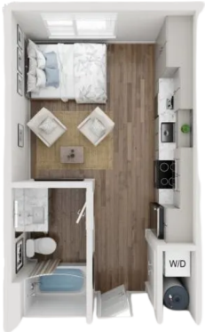
OXYGEN MICRO - 352 SF