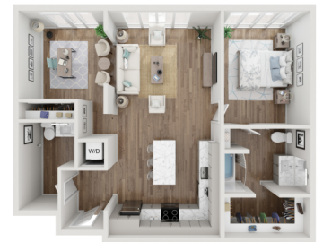
NITROGEN ALPHA LIVE WORK 1,061 SF