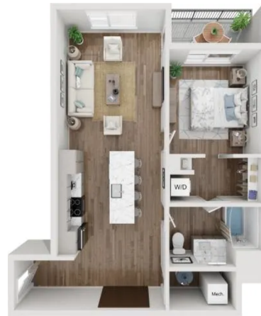
NITROGEN COBALT - 798 SF