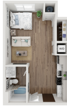
OXYGEN COBALT - 695 SF