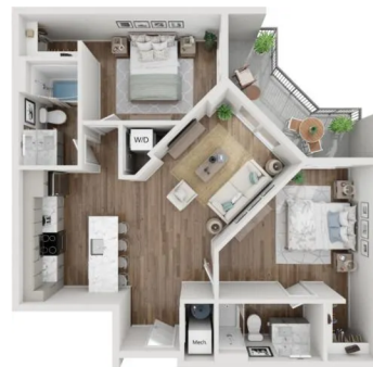
HYDROGEN CARBON - 1,000 SF