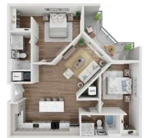
HYDROGEN ALPHA - 1,074 SF