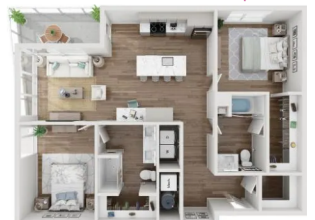
HYDROGEN MAX - 1,178 SF

*All renderings & square footages are approximations. Floor plan sizes & finishes may vary.